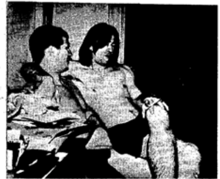
Our own specious student lounge offers opportunities to brush up on basic skills.