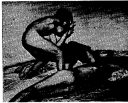
* try a few opening exercises