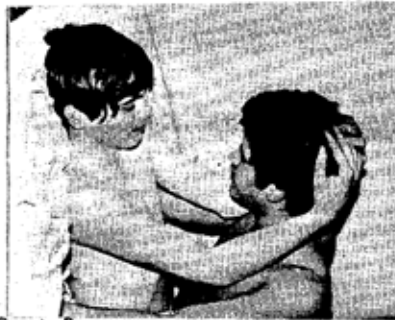
* Good faculty student relations